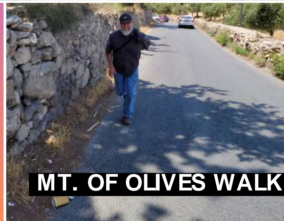
MT. OF OLIVES WALK