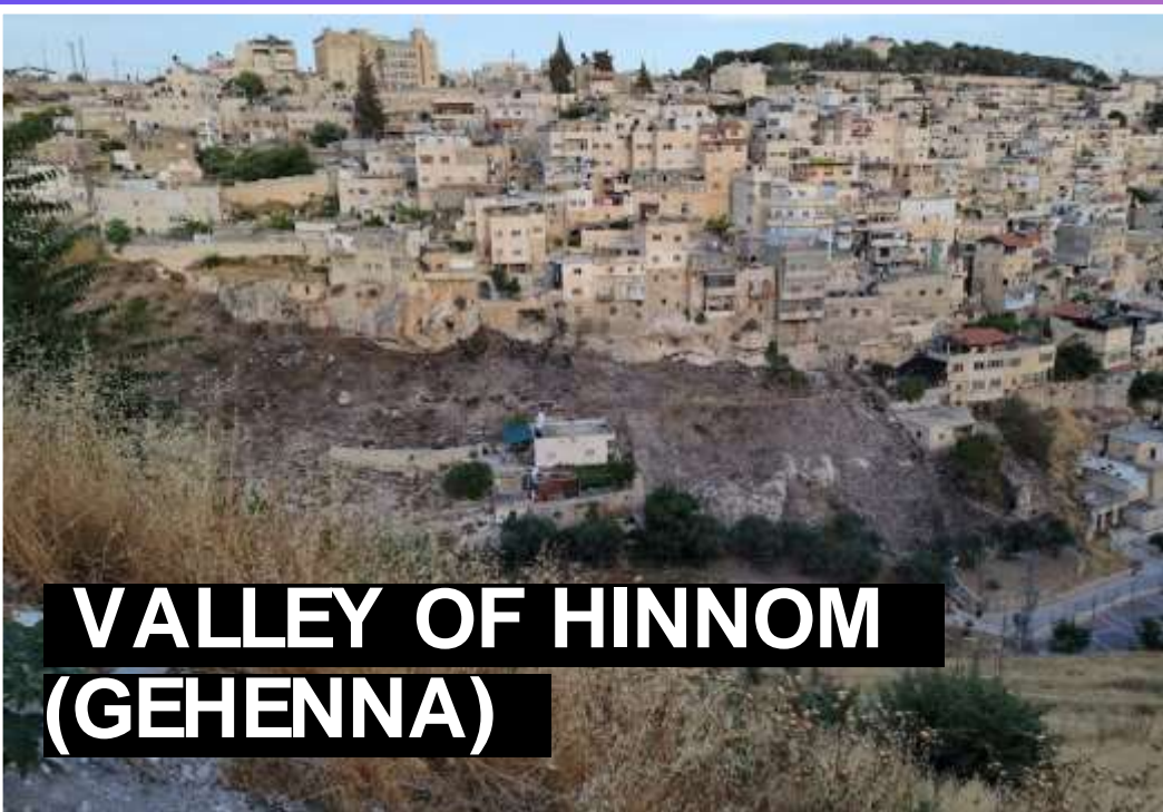
VALLEY OF HINNOM (GEHENNA)